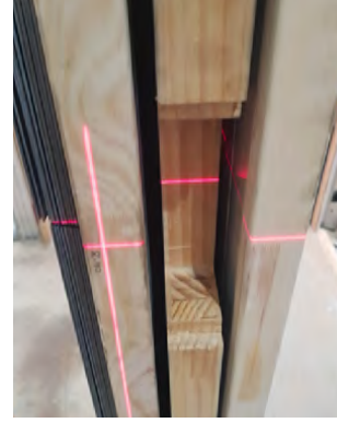
Testing at Cavity Sliders Ltd research & testing facility.

*Wall lining can be substituted to a different brand or weight so long as the manufacturer provides certification of its capability to support the required loading.