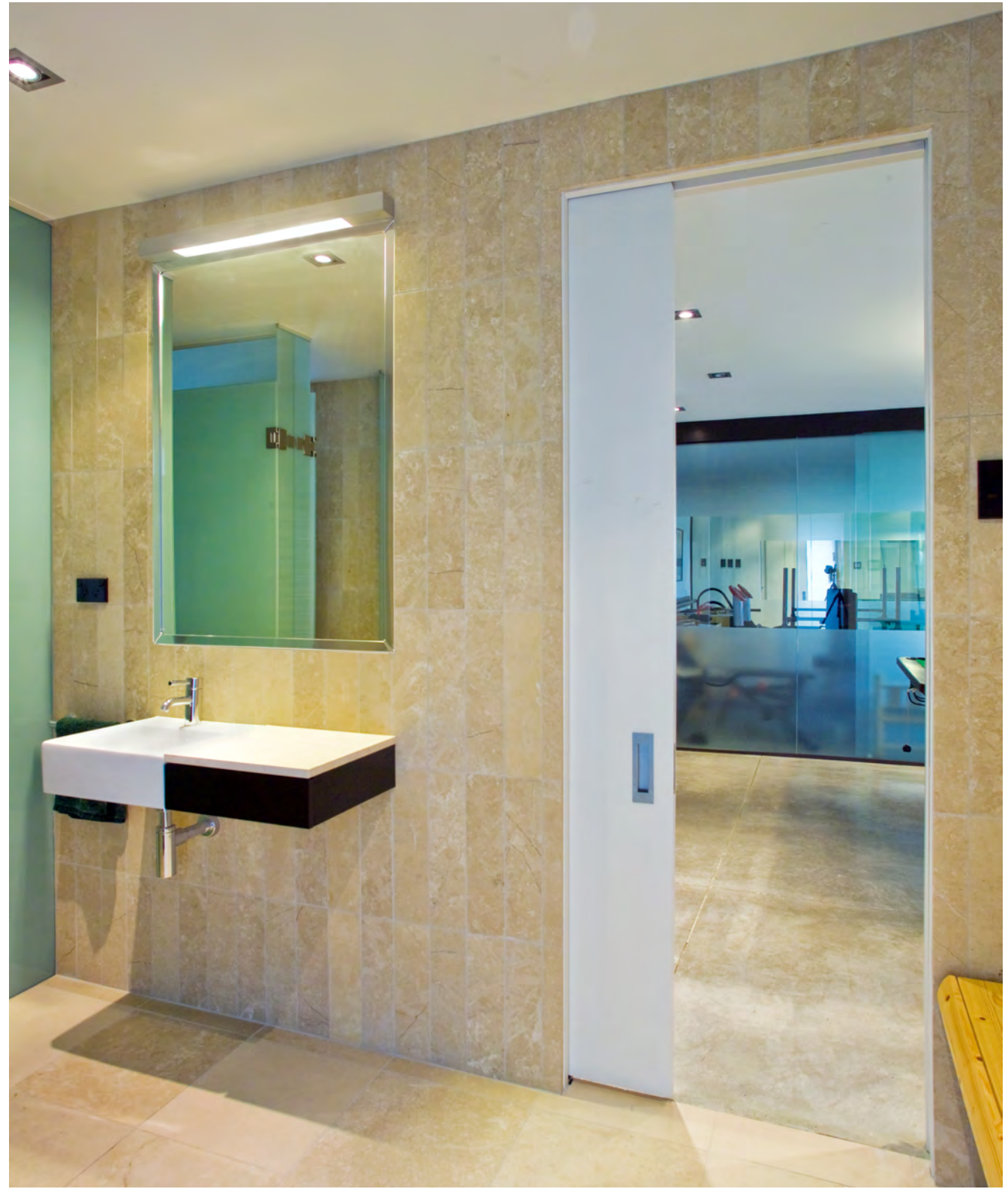
CS Cavity Slider with flush door in tiled bathroom