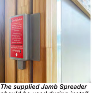
should be used during install.